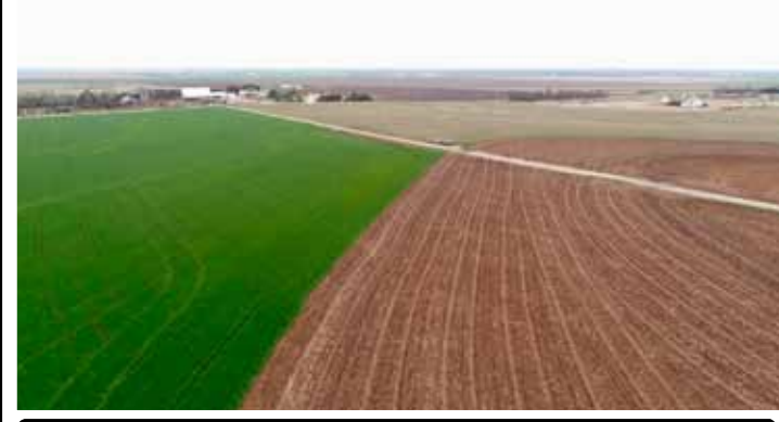
TERMS: Earnest money is $35,000 down at the conclusion of the Auction with the balance due upon Sellers submission of merchantable title and closing. Closing date shall be on or before June 5, 2017. Closing fee and title Insurance fee will be split 50/50 between Seller and Buyer. Selling subject to easements, restrictions, roadways and rights of way. This property is not selling subject to financing or inspections. Interested buyers need to view the property prior to the date of the auction and have financing available and any inspections performed prior to bidding. All pertinent information is available upon request. All announcements made the day of the auction take precedence over any other announcements or printed material.